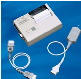
Thermal printer with interface cables.